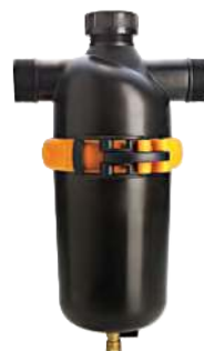
2" DUAL LITE FILTER