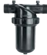
1 1/2" FILTER