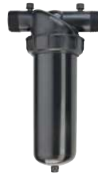
1 1/2" LONG FILTER