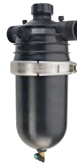
2" DUAL HP FILTER